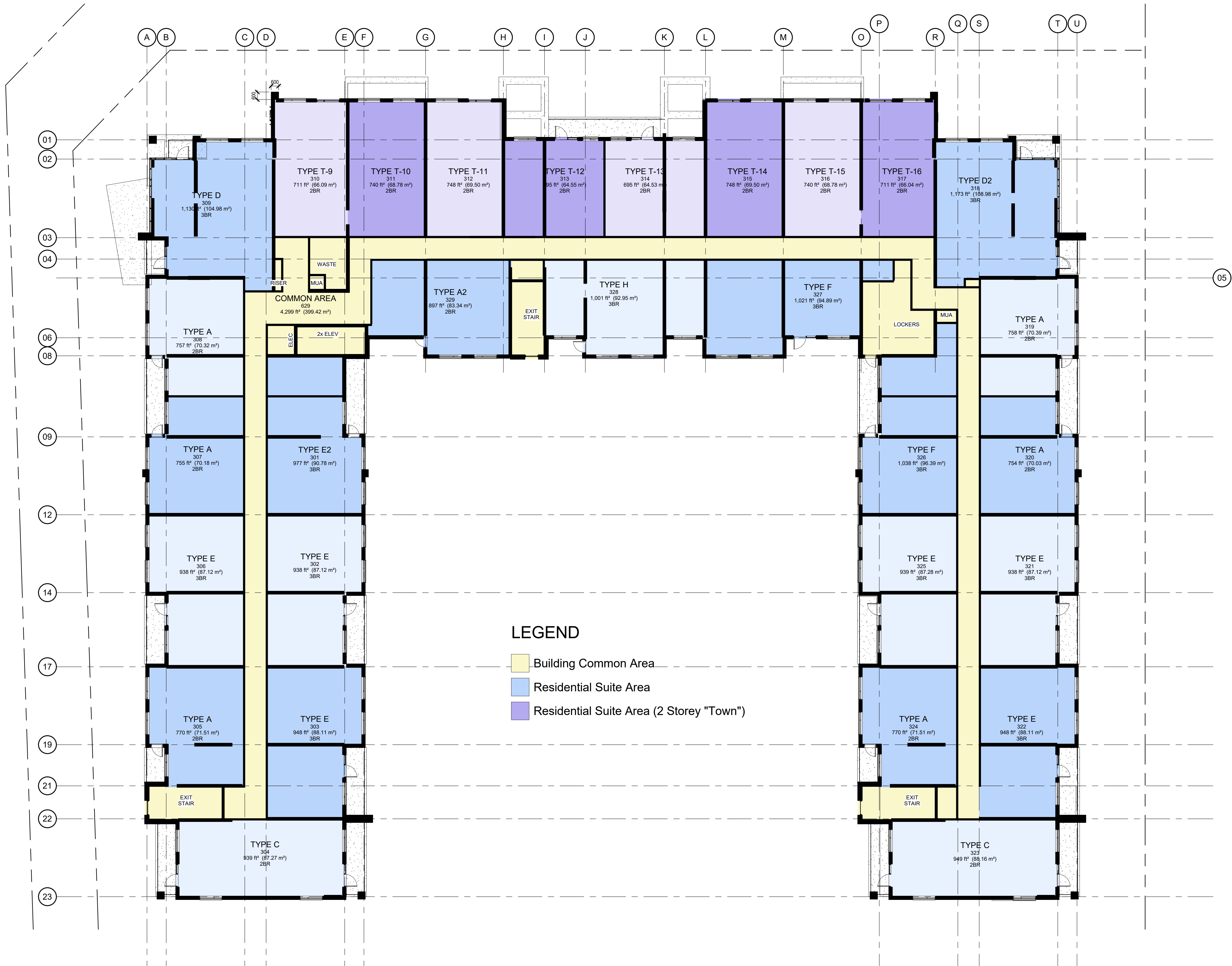
1 3rd FLOOR A203 1:150

CONTRACTOR MUST CHECK AND VERIFY ALL DIMENSIONS AND JOB CONDITIONS BEFORE PROCEEDING WITH WORK ALL DRAWINGS MAY BE TO BE SUBJECT TO CHANGE DUE TO COMMENTS FROM MUNICIPAL DEPARTMENTS AND OTHER AGENCIES WITH AUTHORITY ALL DRAWINGS AND SPECIFICATIONS ARE THE PROPERTY OF THE ARCHITECTS AND MUST BE RETURNED AT THE COMPLETION OF THE WORK THE CONTRACTOR WORKING FROM DRAWINGS NOT SPECIFICALLY MARKED FOR CONSTRUCTION MUST ASSUME FULL RESPONSIBILITY AND BEAR COSTS FOR ANY CORRECTIONS OR DAMAGES RESULTING FROM HIS OR HER WORK