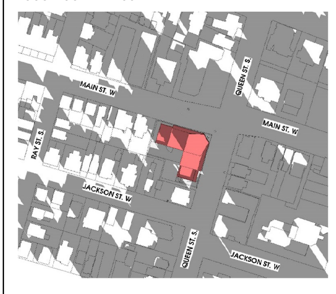
December 21st 12pm