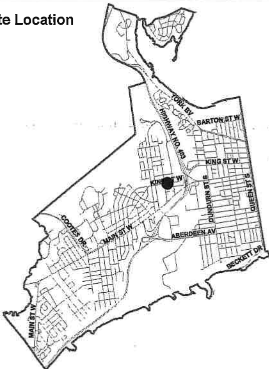
Key Map - Ward 1