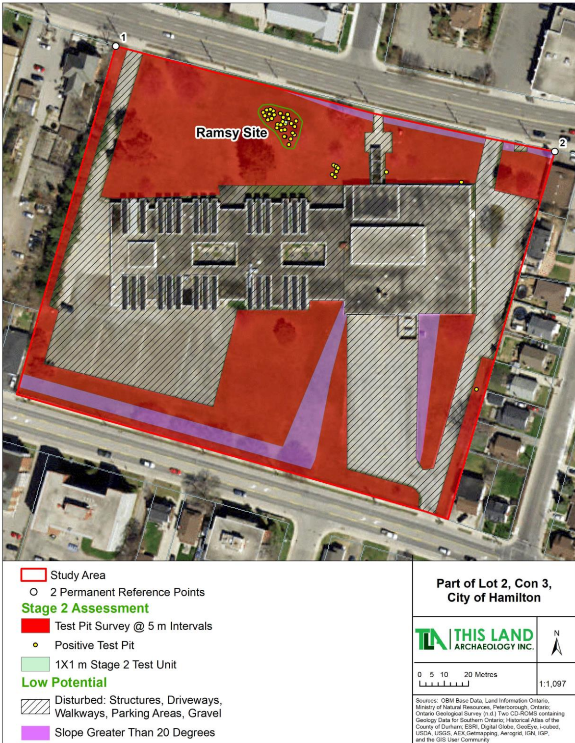
Figure 6b: Results of Stage 2 assessment (positive test pits shown) with two permanent reference points.