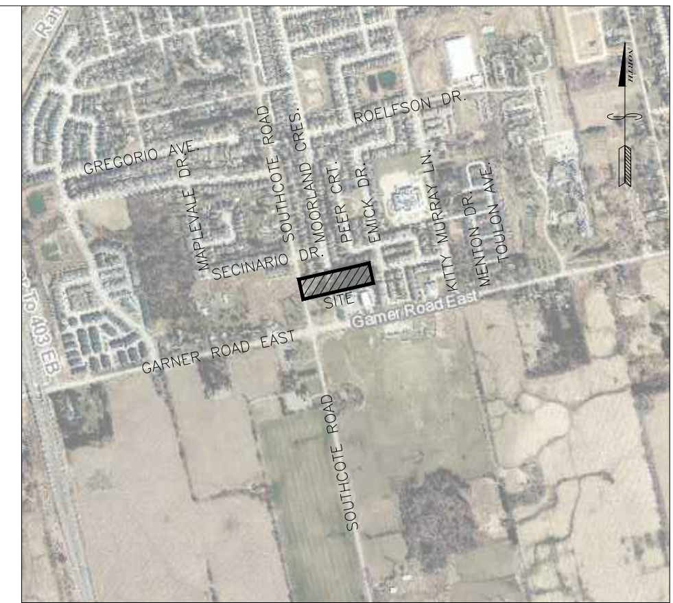
KEY PLAN N.T.S.

BENCHMARK NOTE: ELEVATION = 247.650 (CGVD-1928:1978) MONUMENT: 00819890294 SIB WITH BRASS CAP - CONTROL POINT IS LOCATED ON THE SOUTHEAST CORNER OF HIGHWAY 53 AND SOUTHCOTE ROAD.